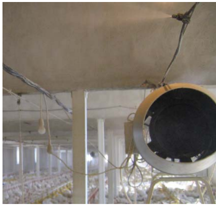
Single Nozzles with heaters

Price conscious farmers in the Middle East have chosen our nozzles for solving their problems i.e. high temperature stress, disease control, crop protection and so on. And quality conscious farmers in Japan have used ours for several years.