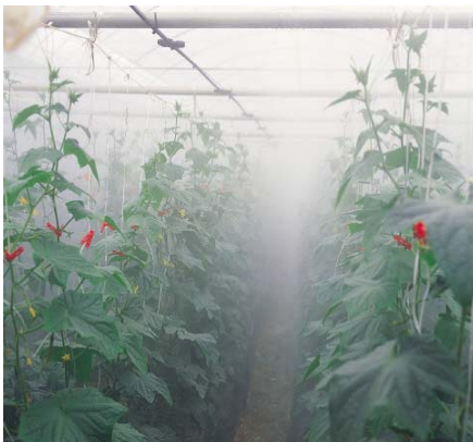
Double Nozzles for Crop protection