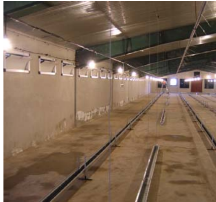
Nozzles above windows for cooling and humidification